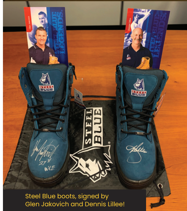
Steel Blue boots, signed by Glen Jakovich and Dennis Lillee!