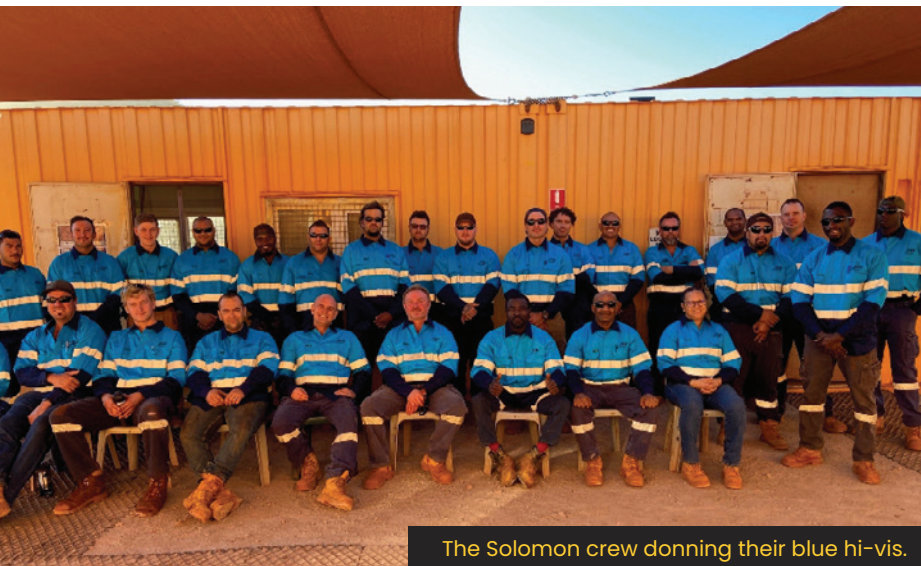
The Solomon crew donning their blue hi-vis.