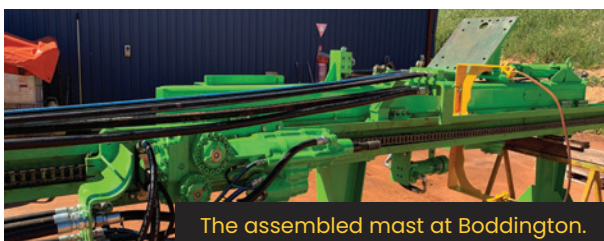
The assembled mast at Boddington.