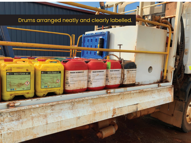
Drums arranged neatly and clearly labelled.