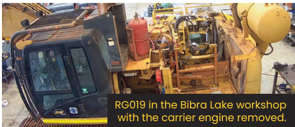
RG019 in the Bibra Lake workshop with the carrier engine removed.

Once the works were complete, the carrier was transported back to the Boddington workshop to be reassembled.