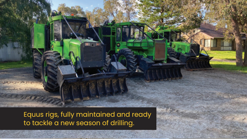
Equus rigs, fully maintained and ready to tackle a new season of drilling.