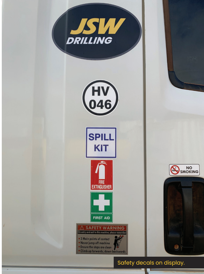
Safety decals on display.