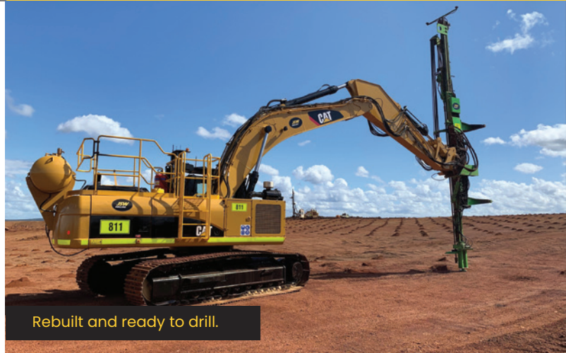
Rebuilt and ready to drill.

Operations commenced again in late August, with a number of new personnel joining the crew, who will be trained by senior employees to ensure they have the skills and knowledge needed to safely carry out operations on site.