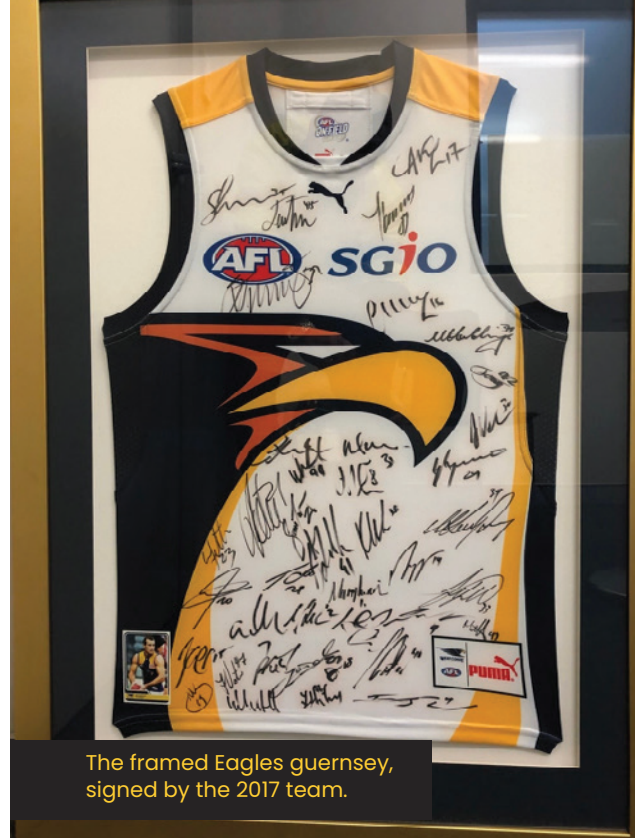
The framed Eagles guernsey, signed by the 2017 team.

The crew at Solomon showed their support by donning blue hi-vis shirts throughout October as a means of raising awareness and starting the conversation around mental health. Some members took the opportunity to share their own personal stories, a meaningful and moving experience that showed no one has to struggle alone.