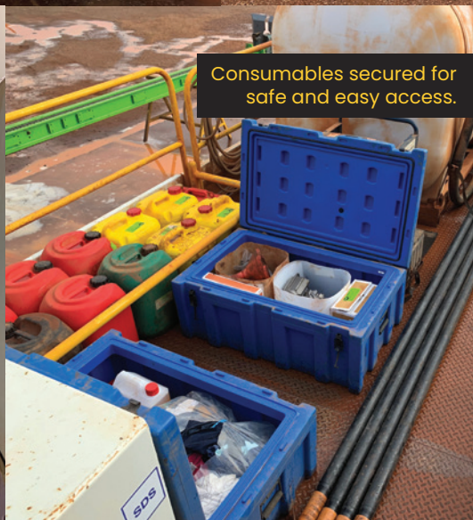
Consumables secured for safe and easy access.