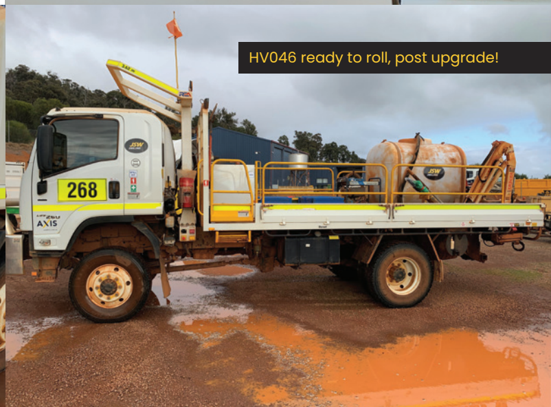
HV046 ready to roll, post upgrade!