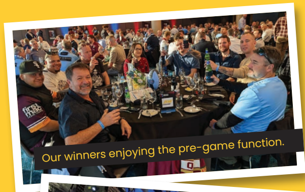
Our winners enjoying the pre-game function.

While there could only be one winner of the game, we think everyone was a winner at this table!