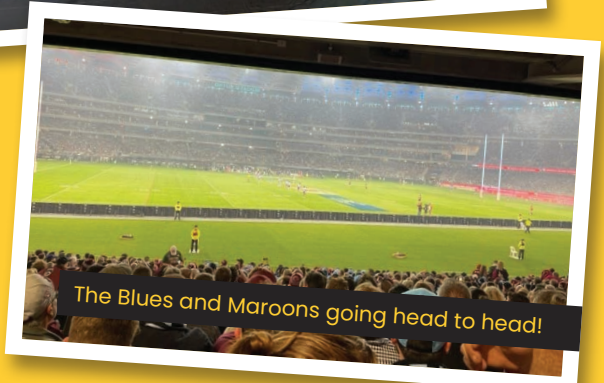
The Blues and Maroons going head to head!