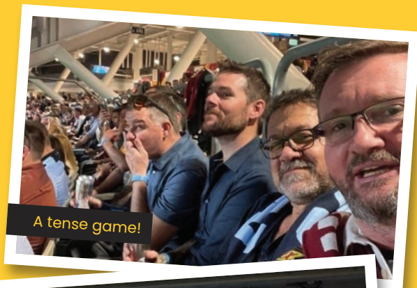
A tense game!