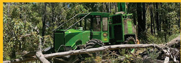
Crew members on site with the Equus rig.