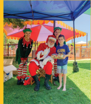
Santa and his helpers paid a visit!