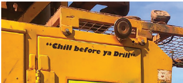
A 'Chill before ya Drill' sticker in action at Solomon!

We would like to thank Justin for going the extra mile and demonstrating our values of passion, collaboration and safety. It's fantastic to see crew members contribute their ideas and initiatives to make a positive impact on site.