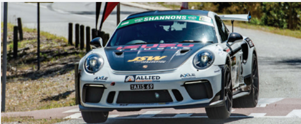
Mark racing at the Targa West Make Smoking History event in September.