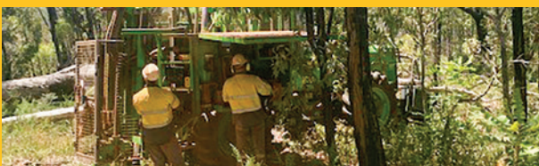
The Equus tackling challenging terrain in the south-west region.

As the Summer sun warms up, hydration testing is at the forefront of our site safety focus. Company procedures are being adhered to ensure crews and equipment can operate under difficult conditions with minimal risk.