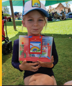
The children each received a special gift from Santa.

The highlight of the day was a visit from Santa and his helpers, who brought special gifts to the children.