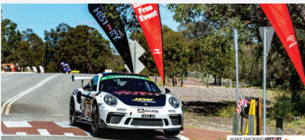
2019 Porsche 911 GT3 RS decked out in the JSW logo!