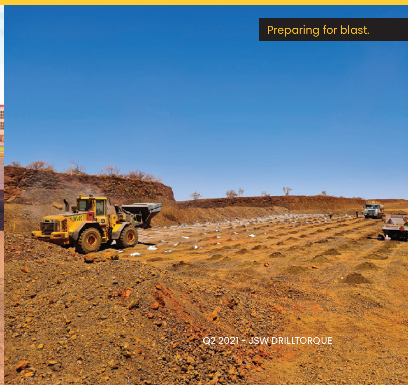
Preparing for blast.