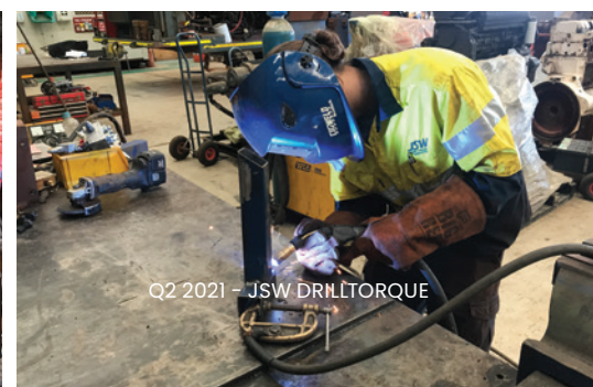
Q2 2021 - JSW DRILLTORQUE