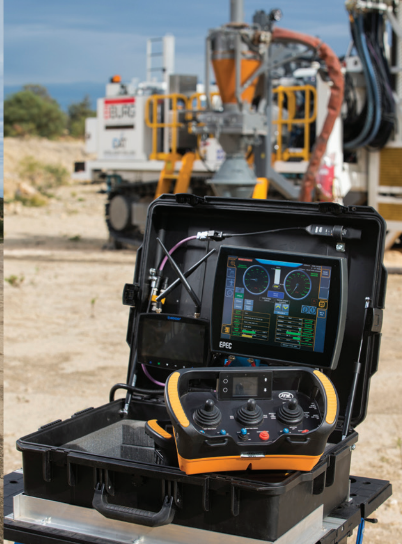
Paving the way to advanced drilling automation.