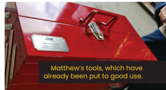
Matthew's tools, which have already been put to good use.