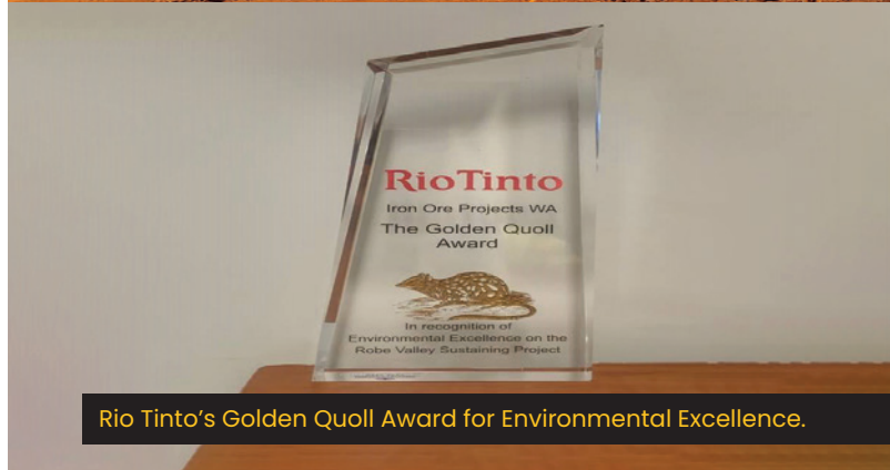
Rio Tinto's Golden Quoll Award for Environmental Excellence.