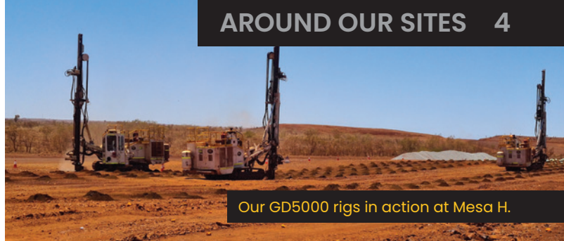
Our GD5000 rigs in action at Mesa H.

Both projects, located in the Pilbara and owned by Rio Tinto, were completed with an exceptional safety record and some impressive productivity achievements.