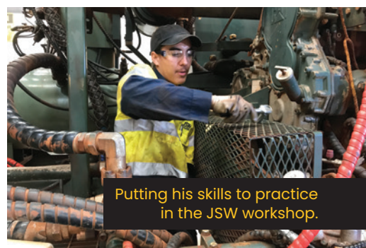
Putting his skills to practice in the JSW workshop.