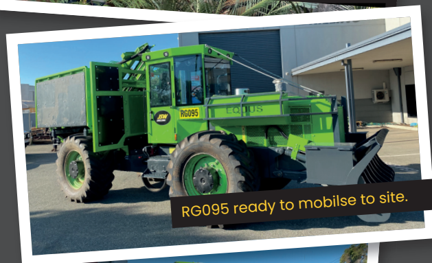
RG095 ready to mobilise to site.